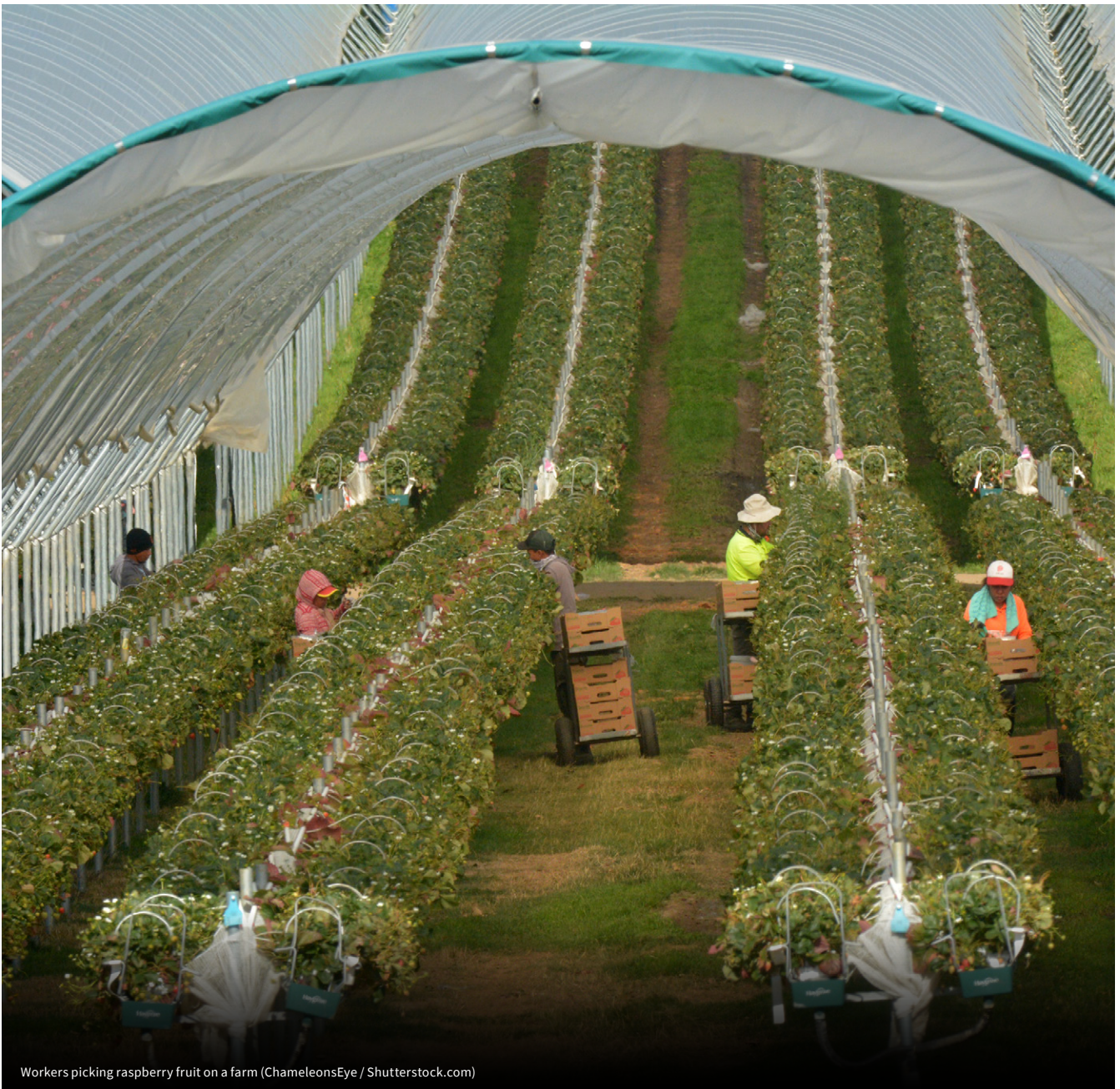
Workers picking raspberry fruit on a farm

If Australia is truly committed to eradicating modern slavery, it must adopt fairer policies in order to minimise the vulnerability of people on temporary protection who are living and working in our community, rather than needlessly exacerbating the risk that they will face serious labour rights abuses by virtue of their insecure visa status. Companies should also be more proactive in the way they identify and address risks to refugees with temporary migration status, and should take a human rights-based approach in order to minimise the risk of harm being faced by workers in their supply chain.