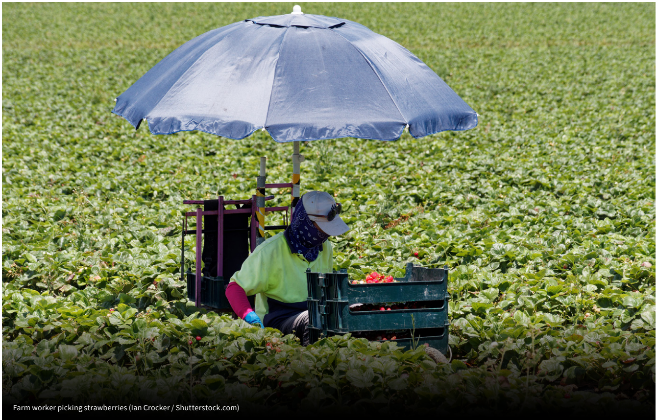
Farm worker picking strawberries

Due to the impacts of COVID-19 on the precariousness of work and its potential to exacerbate modern slavery practices, the Australian Border Force has also directed companies to include details of how the pandemic has impacted these risks, and how these have subsequently been mitigated. 27